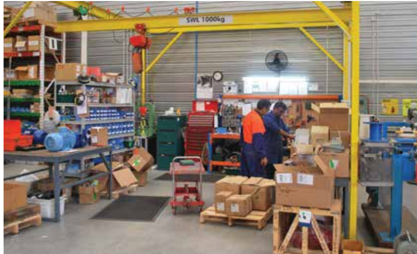
Regal's Auckland workshop is an IEC-certified manufacturing location for hazardous area motors and is audited by Sira

Regal Beloit's acquisition of CMG Electric Motors Ltd, one of Australia's largest electric motors manufacturers, in 2009 heralded a new era for the electric motors industry in New Zealand. In the past five years, the company has been quietly rebranding its presence in the country and consolidating its sales and service facilities in Auckland, Rotorua and Christchurch.